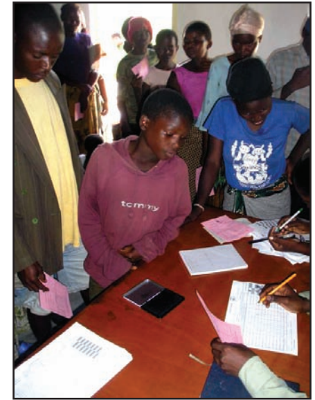
Orphans and vulnerable children signing up to receiving food rations